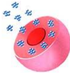
Small water clusters can easily penetrate cells for improved hydration.

readings around 128Hz while bottled mineral water reads between 90 and 100Hz. *National Tsing Hua University Report No. GMC 0203001 dated 28th March 2002.